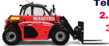
Telehandler 2.5t/6mtr 3t/9mtr