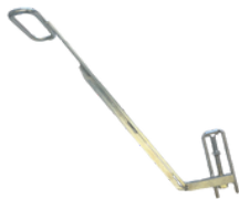
GATIC LID LIFTER