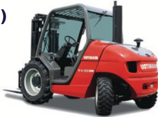
LPG Fork Lift 2.5t