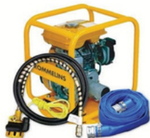
FLEXDRIVE PUMP & DRIVE KIT