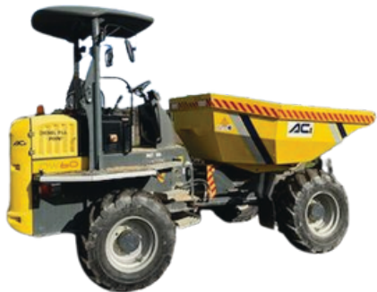
Articulated 6t Side Tipper