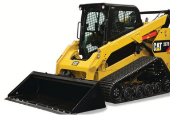
POSI TRACK CAT 247B3 Kubota SVL75