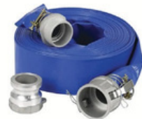
LAY FAT HOSE (WITH CAM LOCKS)