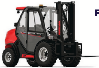
All Terrane Forklift (Buggie) 2.5t 3t