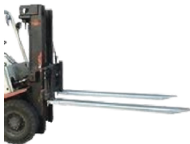
Tynes 1800mm JIB Fork