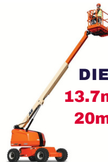
DIESEL 13.7m/45ft 20m/66ft