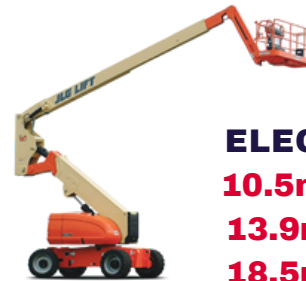
ELECTRIC 10.5m/34ft 13.9m/45ft 18.5m/60ft