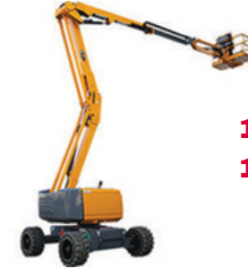
DIESEL 10.5m/34ft 13.7m/45ft 19m/60ft 24m/80ft